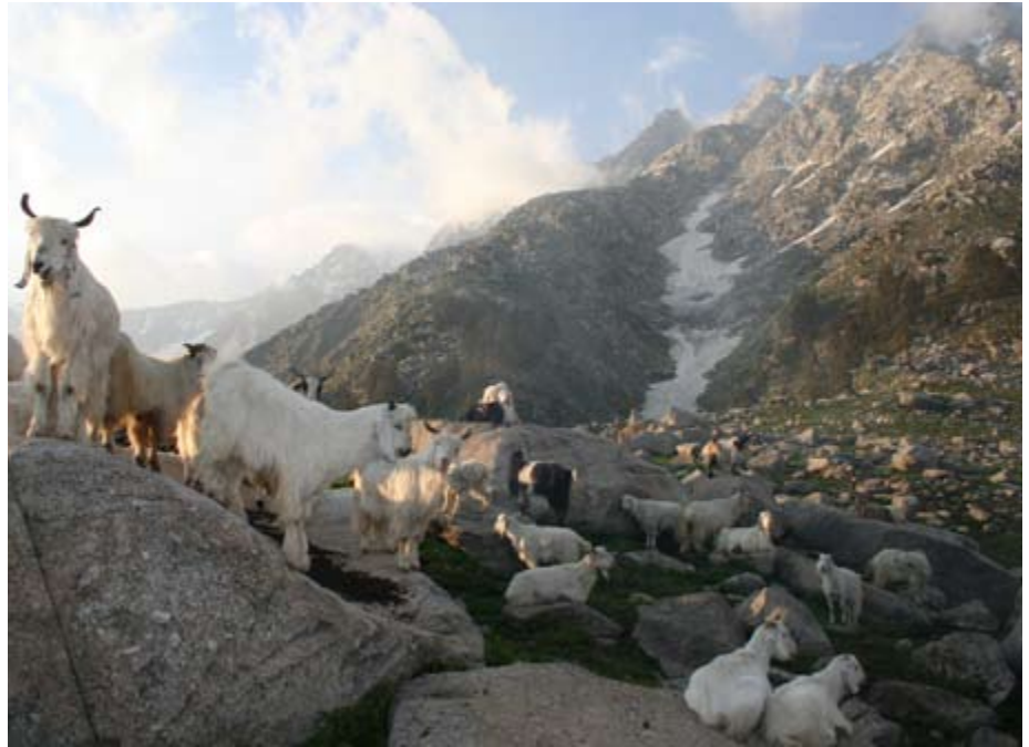
A flock of sheep and goats in the Dhauladhar range, Himachal Pradesh.

Far from denying a pastoralist identity, this research aims at broadening our view of how meaningful relations to the environment are established among the Gaddi. While pastoralism plays an important part in daily life as well as in identity construction, it is not the only activity