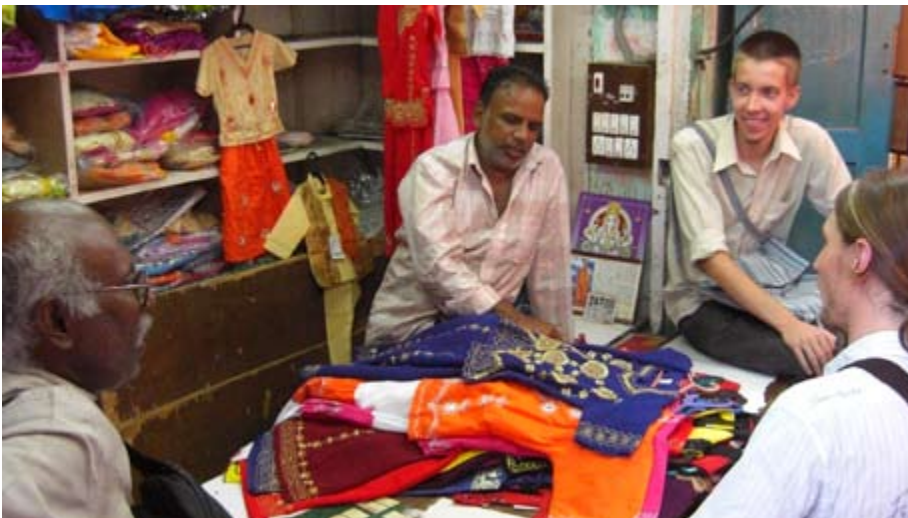
Haggling with merchants in the local language.