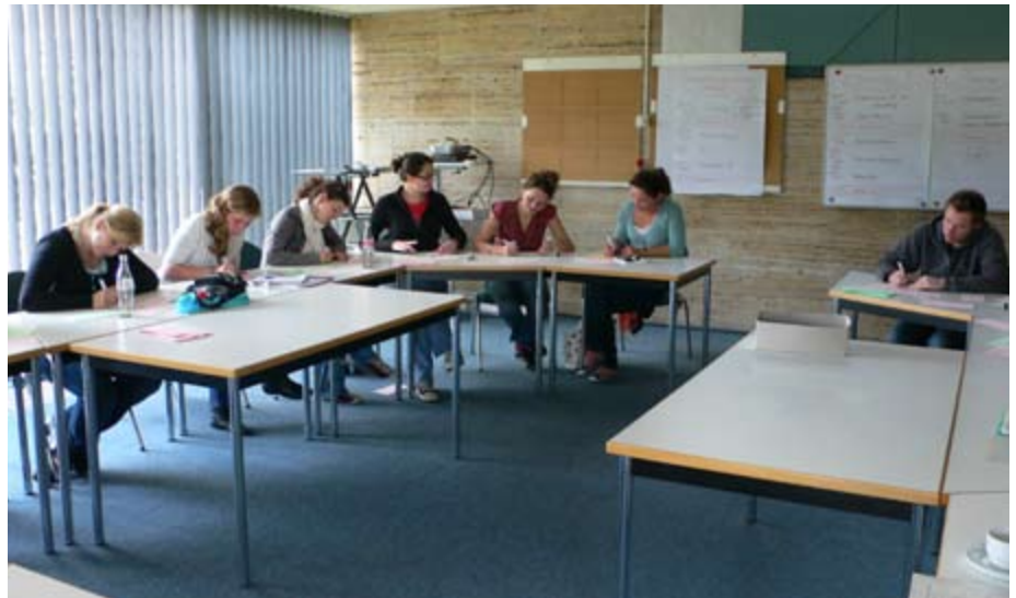
Members of the class of 2008 at the seminar "Reflected practical experience" at Heidelberg University's seminar centre in Oberflockenbach.