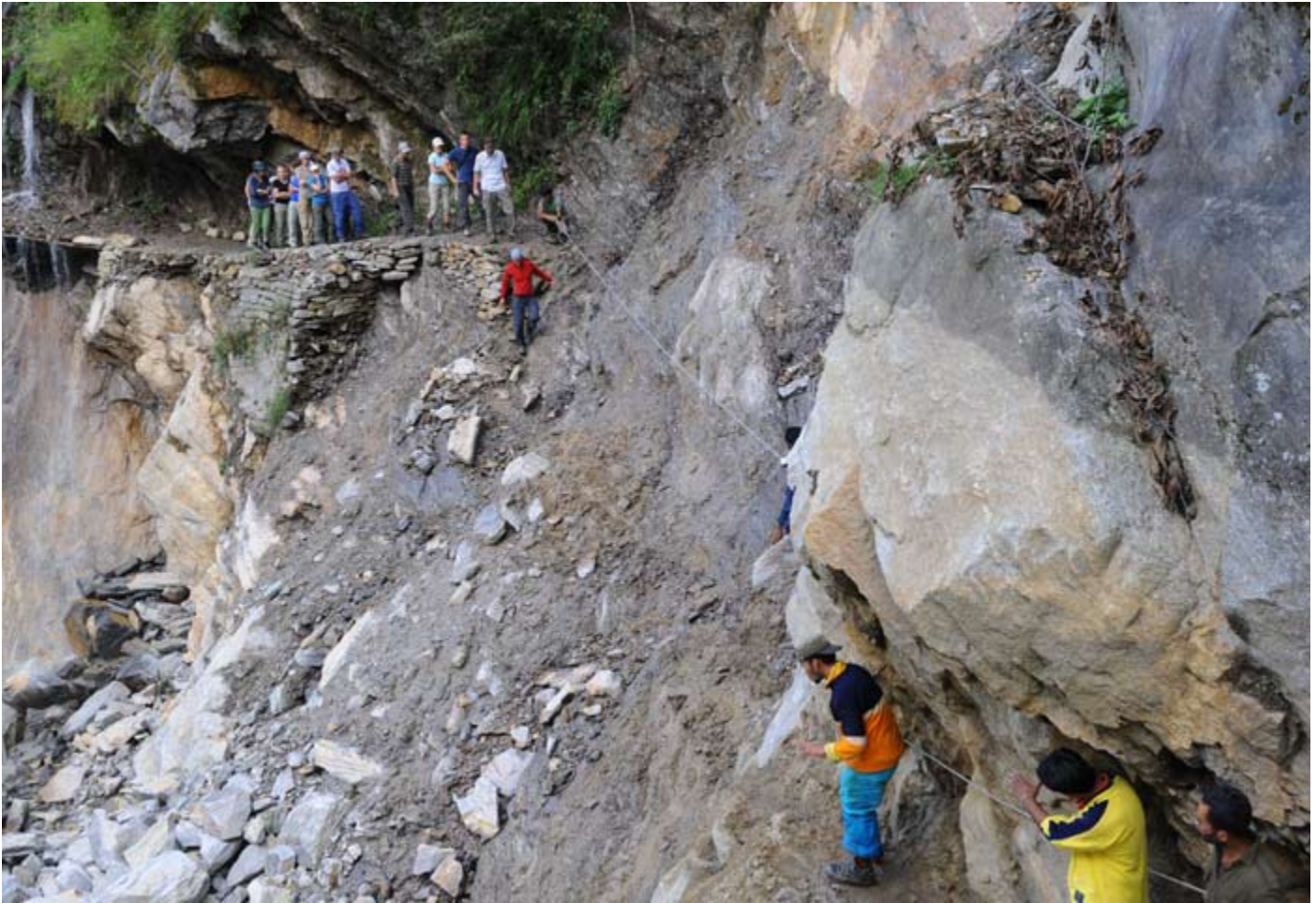
Bridging the gap: landslide in the Gori Valley.