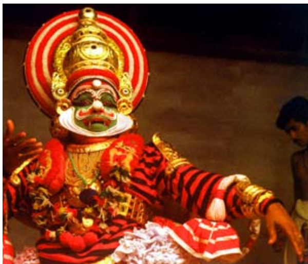
Kuttiyattam theatre: Rama Chakya Ravana.