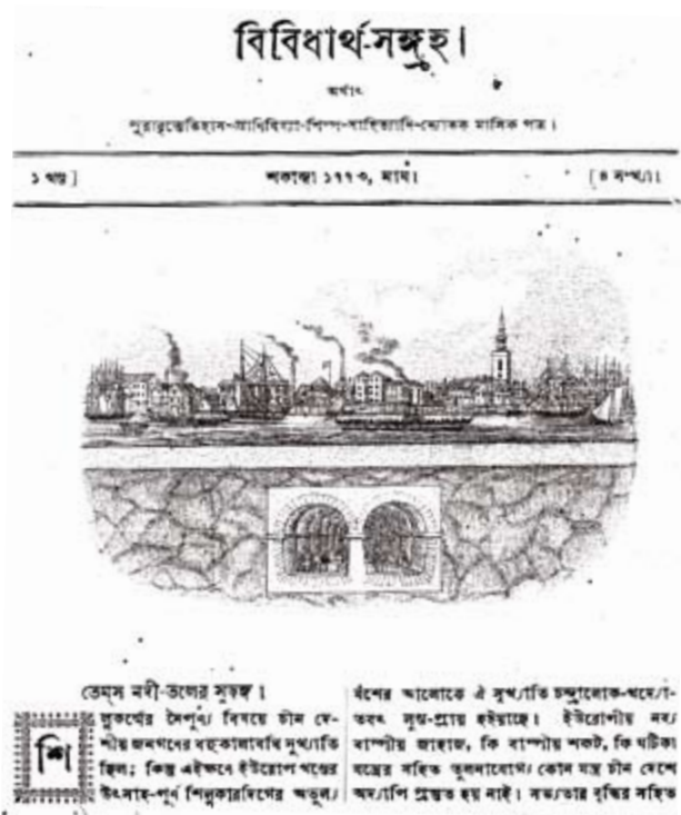
Front page of the Bengali journal Bibidhārtha Samgraha 1,4 of month Māgh, 1773 Shaka (1860), displaying the Thames Tunnel in London.

Huge textual database on colonial Bengal online on SAVIFA