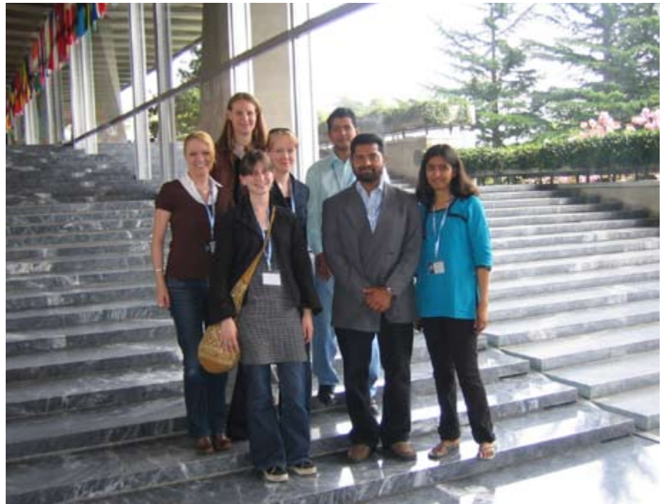
MAHASSA study excursion participants at the World Health Organization headquarters

A further objective of the Geneva visit was to enable the students to establish