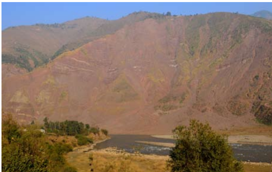
Large landslide in the Jhelum Valley (6 December 2008)

The earthquake which struck the Lesser Himalaya of northern Pakistan and India in October 2005, was one of the deadliest earthquake-disasters in South Asia's recent history. It caused more than 86,000 fatalities and left more than 4 million people homeless as more than 32,000 buildings were destroyed. In addition, the ground motion triggered several thousand landslides and produced extensive fissuring on the slopes, which ren-