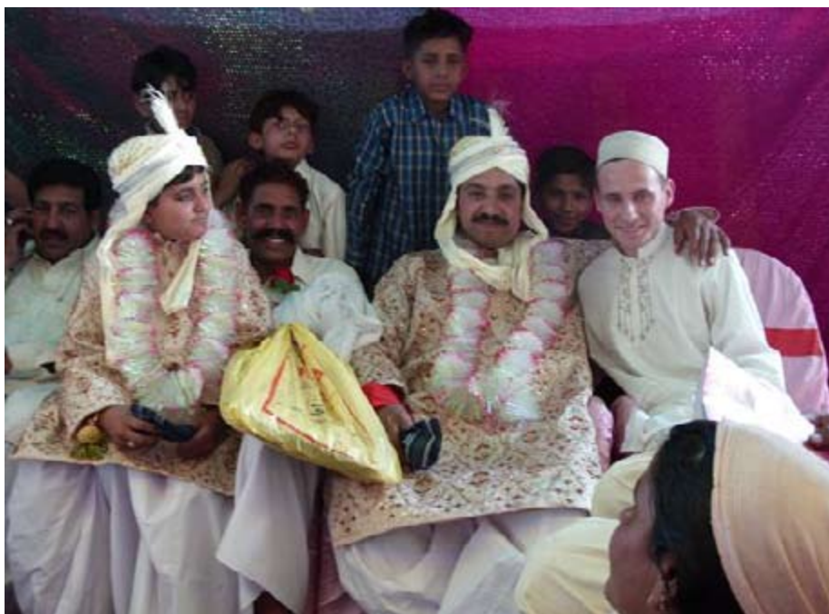
A wedding in the countryside.